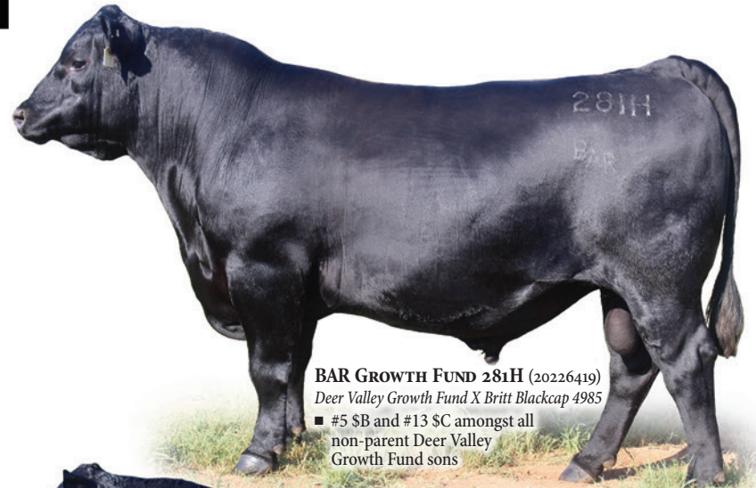
BAR GROWTH FUND 281H (20226419) Deer Valley Growth Fund X Britt Blackcap 4985 ■ #5 $B and #13 $C amongst all non-parent Deer Valley Growth Fund sons

Raised on the ranch, these young commercial females are AI bred and cleaned up with low birthweight BAR bulls. They will begin calving in mid-October.