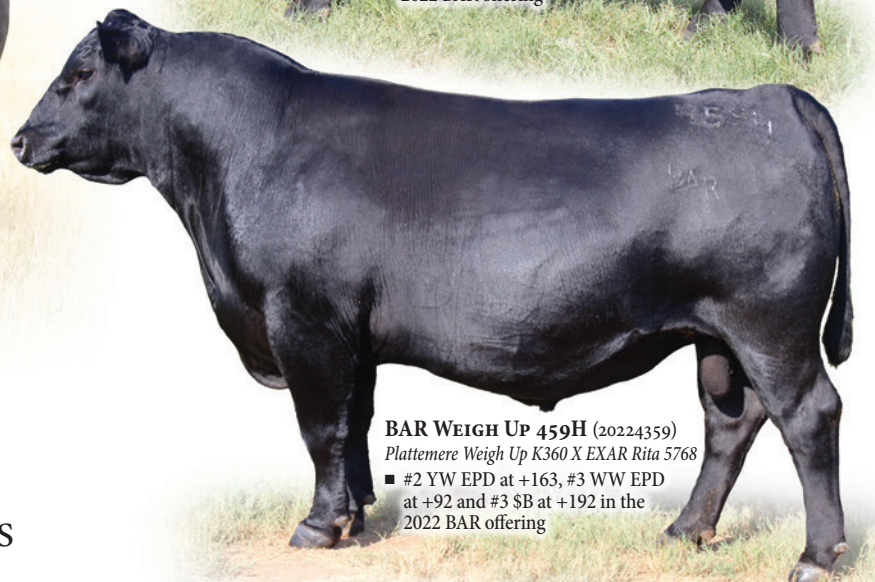
BAR WEIGH UP 459H (20224359) Platiemere Weigh Up K360 X EXAR Rita 5768 ■ #2 YW EPD at +163, #3 WW EPD at +92 and #3 $B at +192 in the 2022 BAR offering