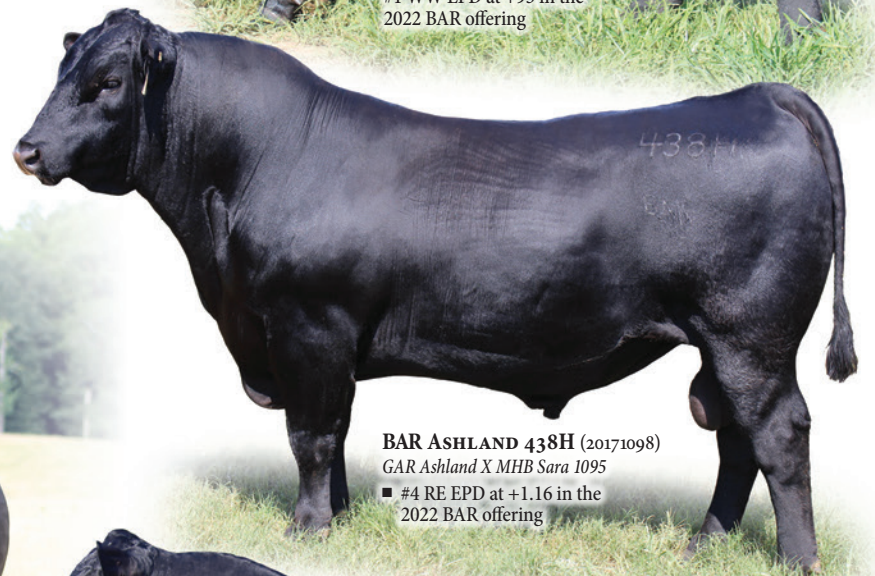
BAR ASHLAND 438H (20171098) GAR Ashland X MHB Sara 1095 ■ #4 RE EPD at +1.16 in the 2022 BAR offering