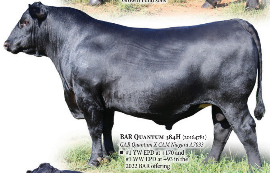
BAR QUANTUM 384H (20164781) GAR Quantum X CAM Niagara A7033 ■ #1 YW EPD at +170 and #1 WW EPD at +93 in the 2022 BAR offering